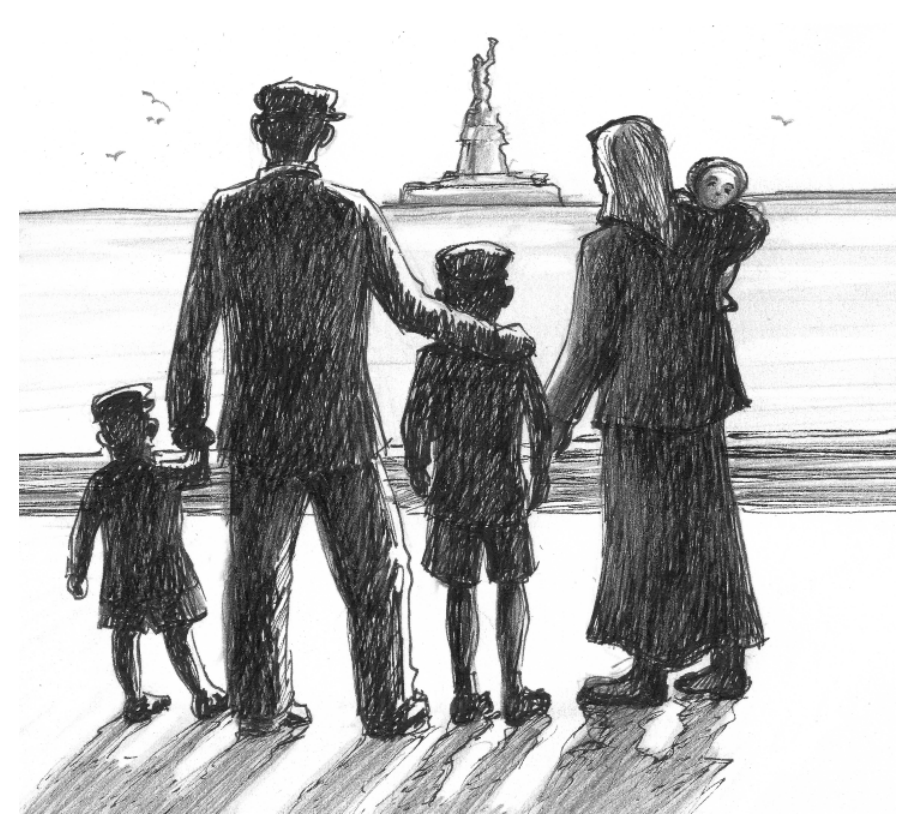
Ellís Island: Gateway To A Dream ~Sketch by Líla Quíntero Weaver